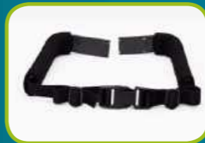
Lateral Arms Width adjustable padded arms and waist strap for all backrests