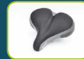
Extra Wide Saddle ◊◆ 30cm x 30cm sprung gel saddle