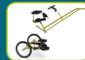
Trailer Bar ◊ Converts most trikes to a trailer Trike™

◊ Tiger Trike ● Hand Propelled Trike ■ Tamara Trike ▲ Roadhog Trike ◆ Bullet Trike (All models)