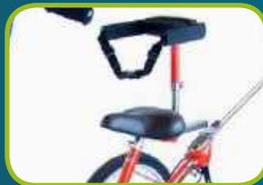
Security Backrest Width and height adjustable with security buckle and strap