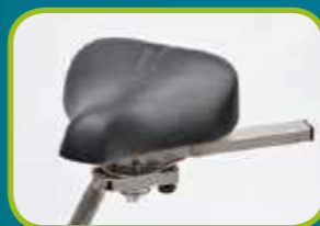
Swivel Seat™ ◊ Various Swivel Seats and saddles for all trikes