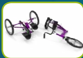
Two Piece Frame Mechanism ◊ 5 second frame separation for easy transport

Some accessories are unavailable for certain products as indicated by the product symbol.