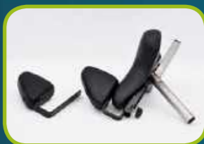
Quick Release Pommel Depth adjustable, quick release pommels for all trikes