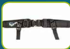
2 point or 4 point Lap-strap High security lap-strap for all trikes