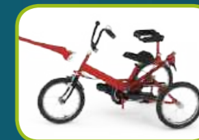
“Clip On” “transportable” Tow Bar ◊●■◆ Converts a trike to a trailer at any time, without disassembly