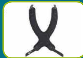
4 point harness Wipe Clean 4 point harness available on upholstered backrests.