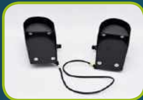
Footshoes with straps Lightweight and fully adjustable with “quick release” straps