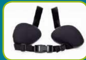
Lateral Pads Independently 3 way adjustable cushioned pads with waist strap