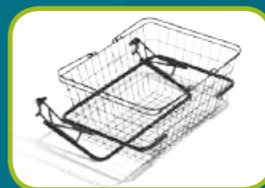
Removable Shopping Basket Loose shopping basket with transport removable bracket