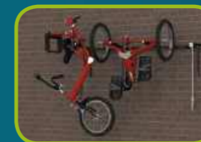
Trike Tidy Flat pack wall storage rack for all Tomcat Trikes