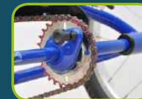
Dual Axle™ ◊▲ Instantly switches axle drive between fixed and free-wheeling