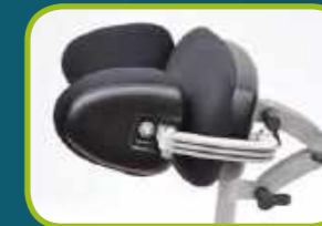
Headrest with wings As sculptured headrest with adjustable upholstered wings