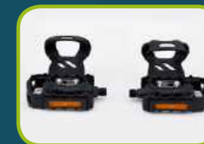
Toe Clips ◊●■ Toe Clips for standard pedals