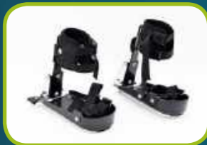
Leg Supports for Footshoe's Fully adjustable for abduction / adduction