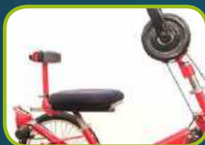
High Stability upholstered seat Hand Propelled trikes only