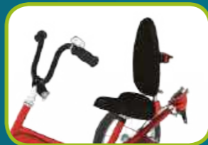
Upholstered Backrest Deep cushioned support with height and tilt adjustment