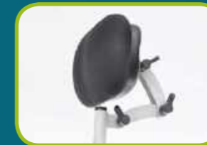
Sculptured Headrest Fully adjustable sculptured and deep upholstered headrest