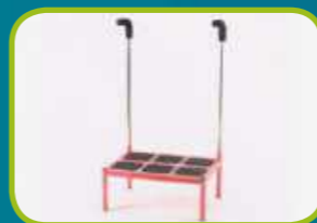
Transfer Step™ ◊●■◆ Enables “manual handling” free trike transfers