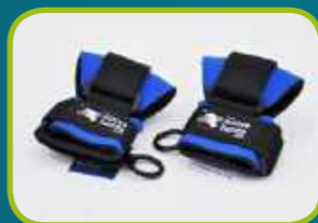
Mitts Left and Right Mitts by Active Hands to Tomcat Design